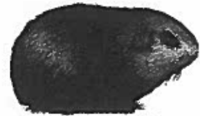
Short-Hair Guinea Pig