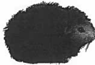
Long-Hair Guinea Pig